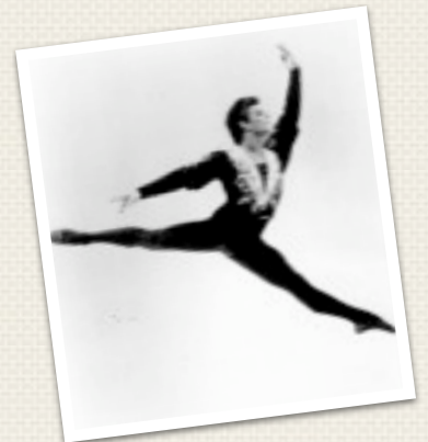
Sugar Plum Cavalier in "The Nutcracker"