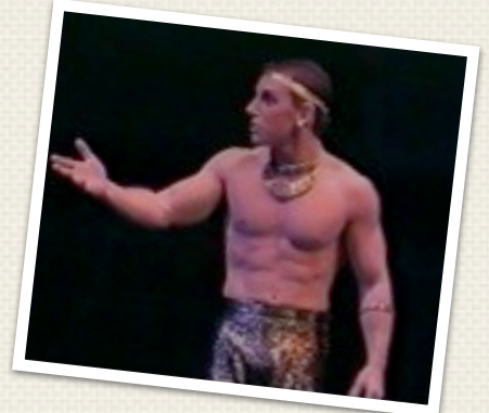
Performing the role of The Genie in The Magic of Alladin filmed for CBC Television