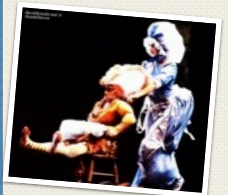
The Ugly Dutchess in Glen Tetley's "Alice."