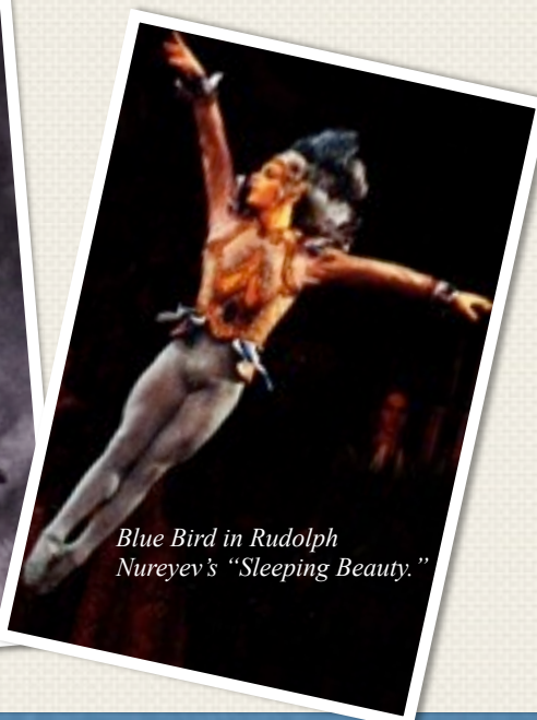
Blue Bird in Rudolph Nureyev's "Sleeping Beauty."